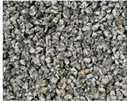
SILVER GRANITE 14mm