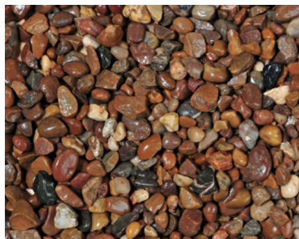
TRENT GRAVEL 20mm