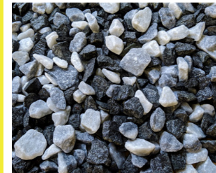
BLACK ICE 20mm