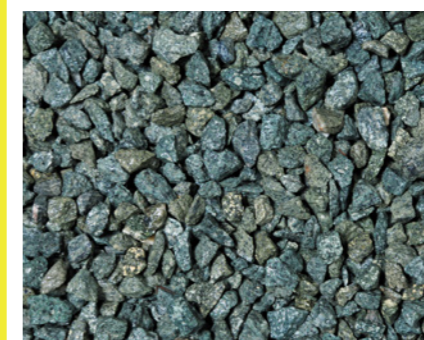
GREEN GRANITE 16mm