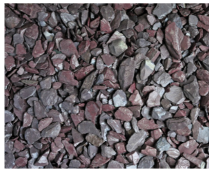
PLUM SLATE 20mm | 40mm