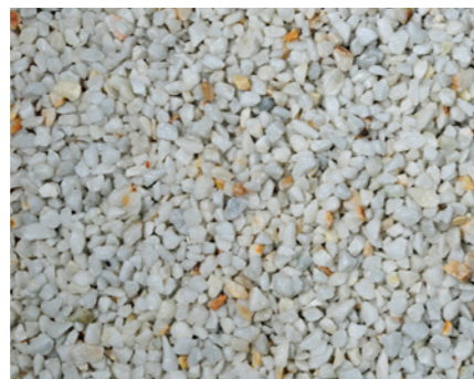
WHITE MARBLE 9-12mm | 14-18mm