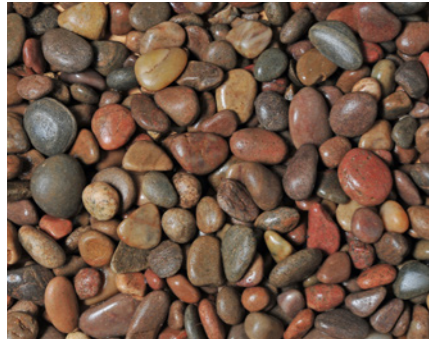
SCOTTISH PEBBLES 20-40mm