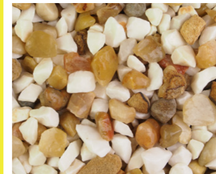
ARCTIC CHAMPAGNE 20mm