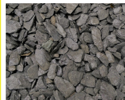
GRAPHITE GREY SLATE 20mm | 40mm