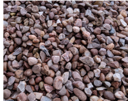
STAFFORDSHIRE PINK 20mm