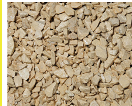
COTSWOLD CHIPPINGS 20mm