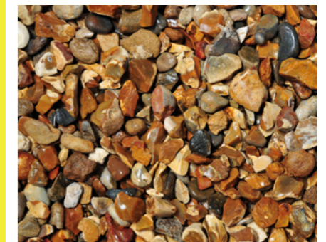
GOLDEN GRAVEL 10mm | 20mm