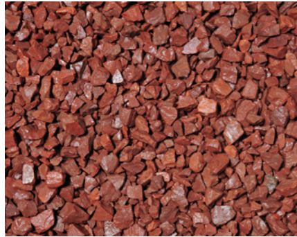
RED GRANITE 14mm | 20mm