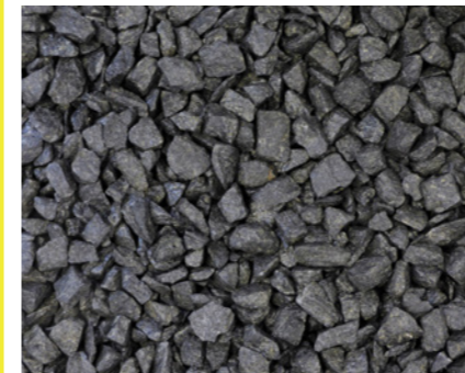
BLACK BASALT 20mm