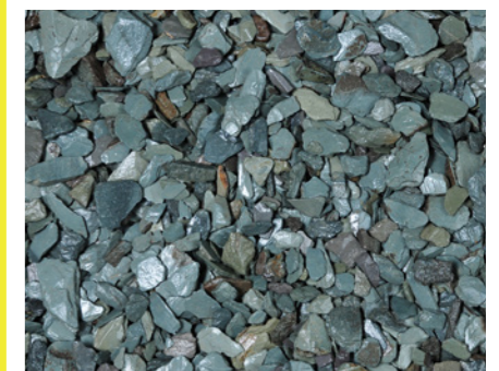
GREEN SLATE 20mm | 40mm