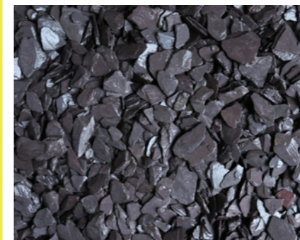
BLUE SLATE 20mm | 40mm