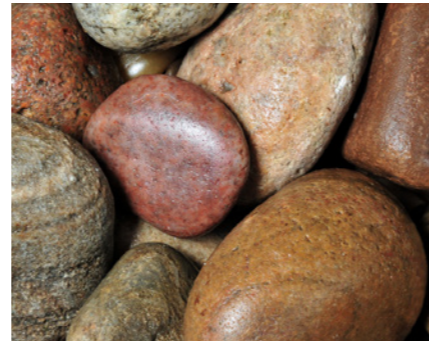
SCOTTISH COBBLES 50-80mm | 80-100mm