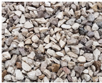
LIMESTONE 10mm | 20mm