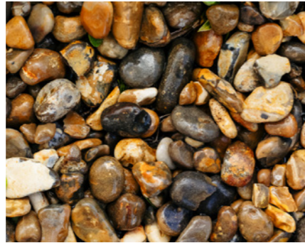
ROUNDED LYDD PEBBLES 20mm