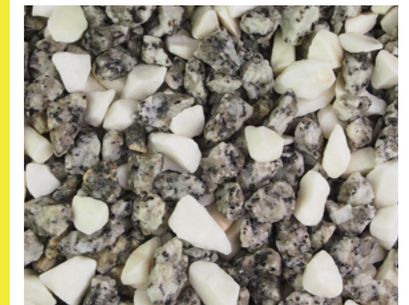
ARCTIC SILVER 20mm